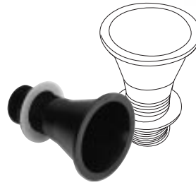
6002 Small circular drip cup (90mm dia cut-out) 1½" outlet.