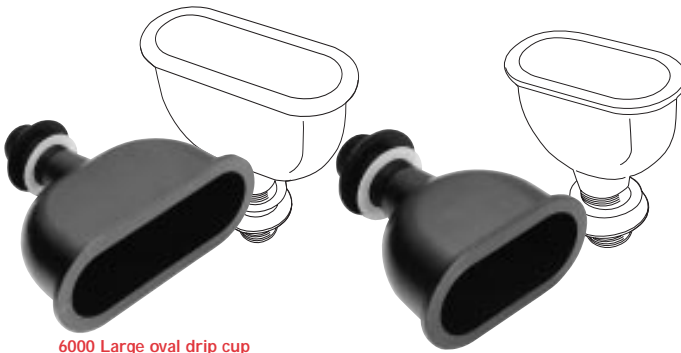
6000 Large oval drip cup (84mm x 240mm cut-out) 1½" outlet.