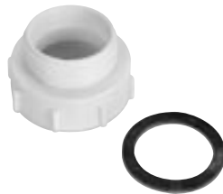
6013 Outlet adaptor for 6003/6023, to give 1 1/2" male connection.