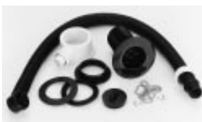
6011 24" Waste fitting with overflow assembly and banjo, 85mm flange, overflow tube is longer dimension (24").