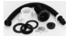
6015 Waste fitting with overflow assembly and banjo, 70mm flange.