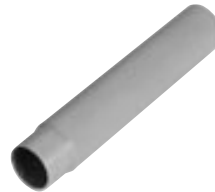
6007 Standpipe for waste fittings 200mm long.

A full range of accessories are available for our bottle traps and drip cup fittings.