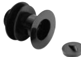
6018 Slotted waste fitting 85mm flange with large size back nut.