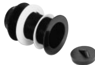
6010 Waste fitting 70mm flange, 1 1/2" outlet (110mm long).