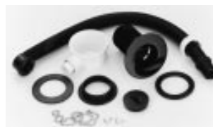
6011 Waste fitting with overflow assembly and banjo, 85mm flange.