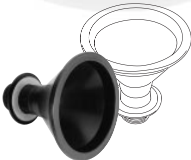
6014 Large circular drip cup (144mm dia cut-out) 1½ outlet.