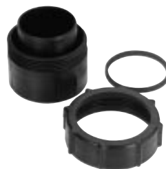
6009 Outlet adaptor for 6003/6023 to suit 38mm o.d. pipe.