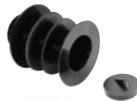
6005 Waste fittings 85mm flange, 1 1/2" outlet (110mm long).