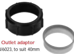
6012 Outlet adaptor for 6003/6023, to suit 40mm o.d. Pipe.