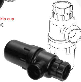
6023 Anti-syphon bottle trap adjustable height neck - requires adaptor 6009, 6012 or 6013 to connect to pipework.